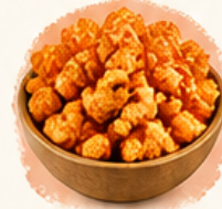
TOMATO HERB POPCORN