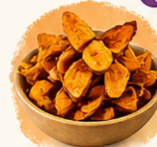
SWEET POTATO CHIPS