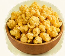
INDIAN MASALA POPCORN

🌿 HIGH IN FIBER 💧 LOW IN OIL ♥️ NO PRESERVATIVES 🌱 100% NATURAL